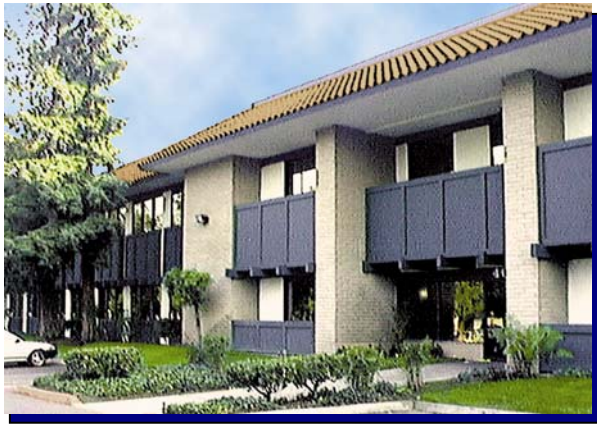
4030 Moorpark Avenue, San Jose

Computer Magic Training is well-known for our fantastic trainers and comfortable training environments ... the best classes in the industry!